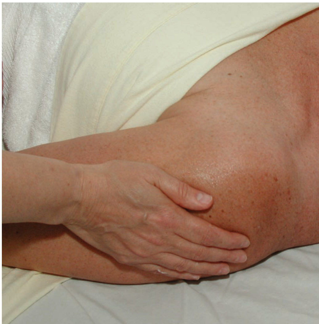
With 12 million cancer survivors in the United States, all massage therapists will need to know how to meet the needs of clients affected by cancer treatment.

“And, I was upset with myself for not speaking up,” Judy laments. It was 18 months before she had enough confidence to receive another massage,