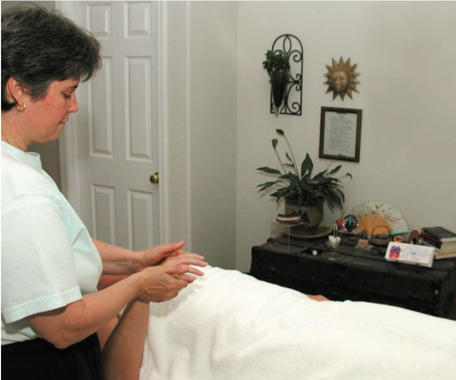
Quality client/therapist communication is crucial when doing oncology massage.

he got her an extra pillow to lie on. “I thought that would be enough and that if I just endured the pain of lying on my stomach, the massage would relax me and it would get better. The pain of lying on my stomach was just too much. Normally when a massage gets near the end, I think, ‘Oh no, don’t let it be over yet.’ This time I couldn’t get off that table fast enough,” she says. “In defense of the therapist, I probably should have been a little more forceful when the pain started. I’m pretty sure he was new and had no experience in the area of ‘massage after surgery.’ While I’ve always enjoyed deep-tissue massage, that probably won’t be the best for me for awhile, if ever.”